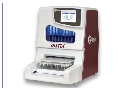
Eclipse 5300 without Filter Changer