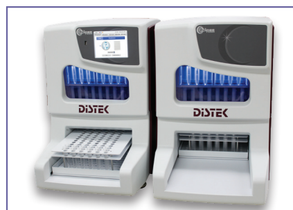
Dual Bath Parent / Child Configuration